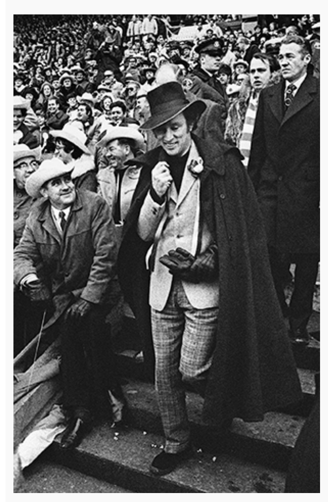
Pierre Trudeau at the 1970 Grey Cup.

In its small way, the picture performs the same function as the entire unusual course he's currently overseeing. The course, prosaically known on the calendar as History 235 (PDF), captures the spirit of a nation in one flash – just like each one of the lectures in this course. The second-year survey course spanning settlement to the 21st century was remade three years ago and transformed from the standard overview of