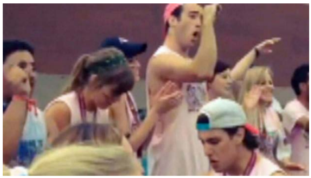
A still image from a video posted on Instagram last year shows students at Saint Mary's University in Halifax participating in a chant that promoted non-consensual sex with underage girls.

By Aleksandra Sagan, CBC News Posted: Sep 05, 2014 5:00 AM ET | Last Updated: Sep 05, 2014 10:17 AM ET