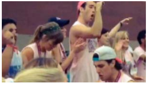
The release of a video in which students at St. Mary's University in Halifax sing a pro-rape chant helped start a national conversation about sexual assault on Canadian campuses.

While schools with higher numbers could have a higher rate of sexual assault compared to other campuses, it could also mean the school is doing a better job of encouraging students to come forward and report incidents.