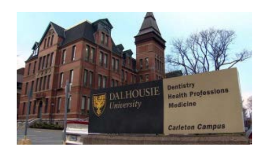
Dalhousie University, which declined to provide data for the CBC survey, was recently rocked by a scandal involving misogynistic comments on Facebook.

"[The CBC survey] found such a variation across the country, I think that it can open up an important conversation. It could also open a conversation up about are we recording them all and how are we responding?" asks