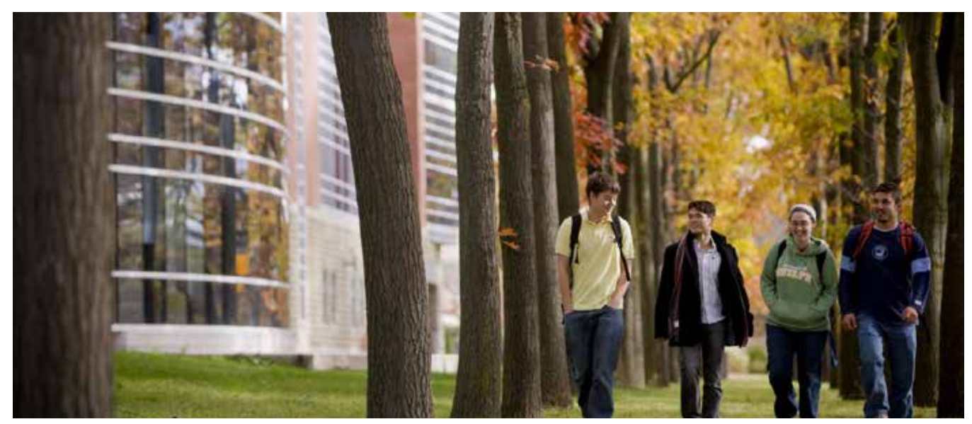
UNIVERSITY OF GUELPH