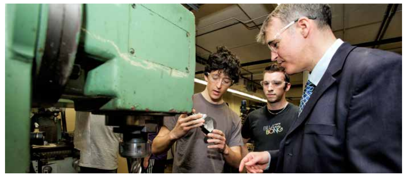
UNIVERSITÉ DE SHERBROOKE