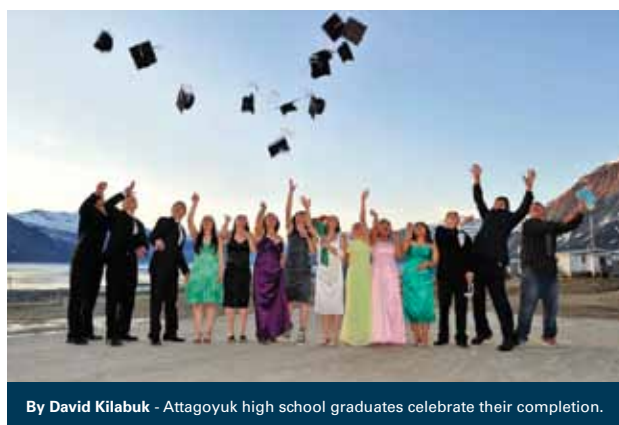
By David Kilabuk - Attagoyuk high school graduates celebrate their completion.

Greater support for childcare program staff should include an increase in training and accreditation opportunities that develop expertise in early childhood education. This long-term goal is consistent with early childhood education research findings identified by Inuit Tapiriit Kanatami (ITK).