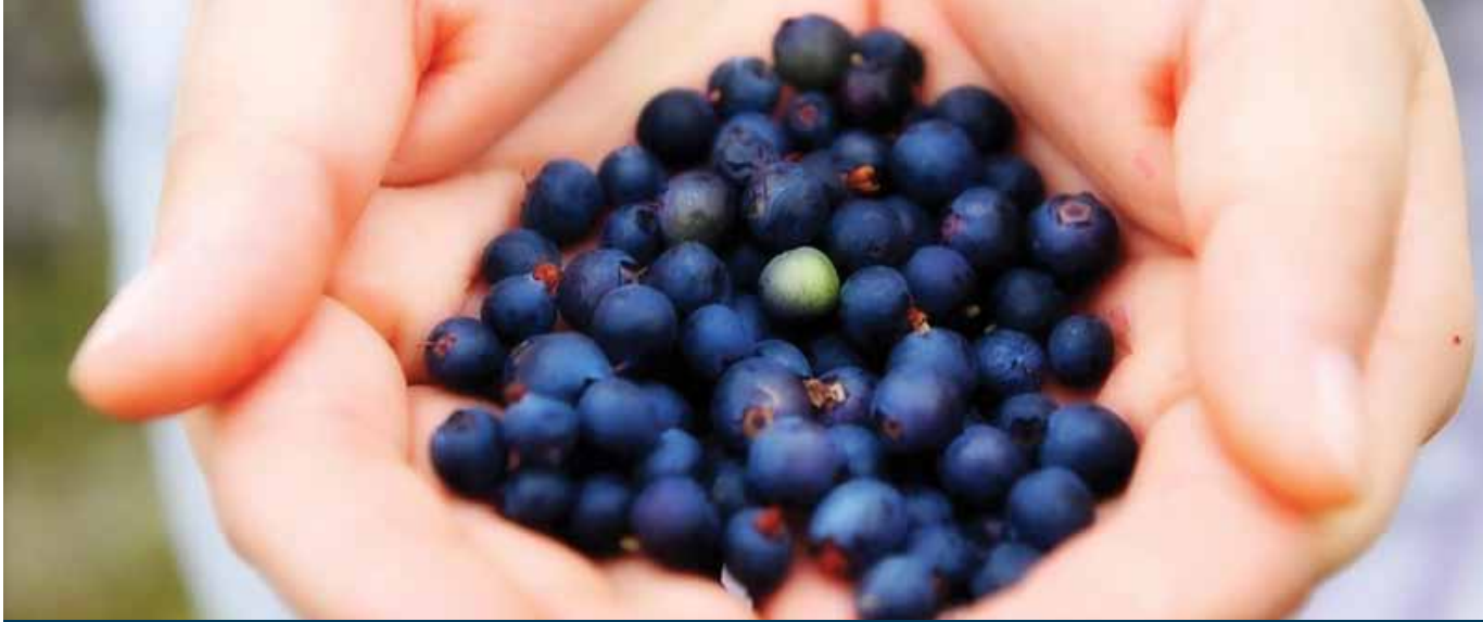
By David Kilabuk - Janine Machmer holds fresh picked berries.

A separate 2007/08 survey of Inuit pre-school age children in 16 communities found that 52.7 per cent of homes were crowded, starkly contrasting with the three per cent of non-Aboriginal homes in Canada classified as crowded, according to the 2006 Census. 119